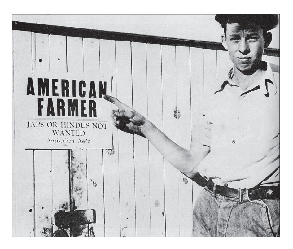
"If I didn't act, then my family members and friends were going to be that much more likely to face similar discrimination later in their lives."