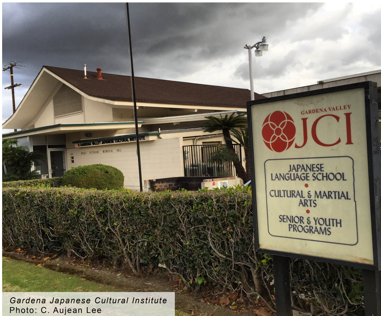
Gardena Japanese Cultural Institute

This year, Asian Pacific Coalition (APC), a coalition of 24 Asian American and Pacific Islander student groups at UCLA, will hold a night market event in May. This event celebrates Asian Pacific American