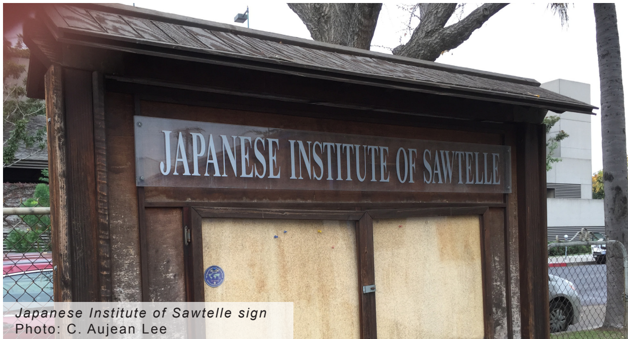
Japanese Institute of Sawtelle sign