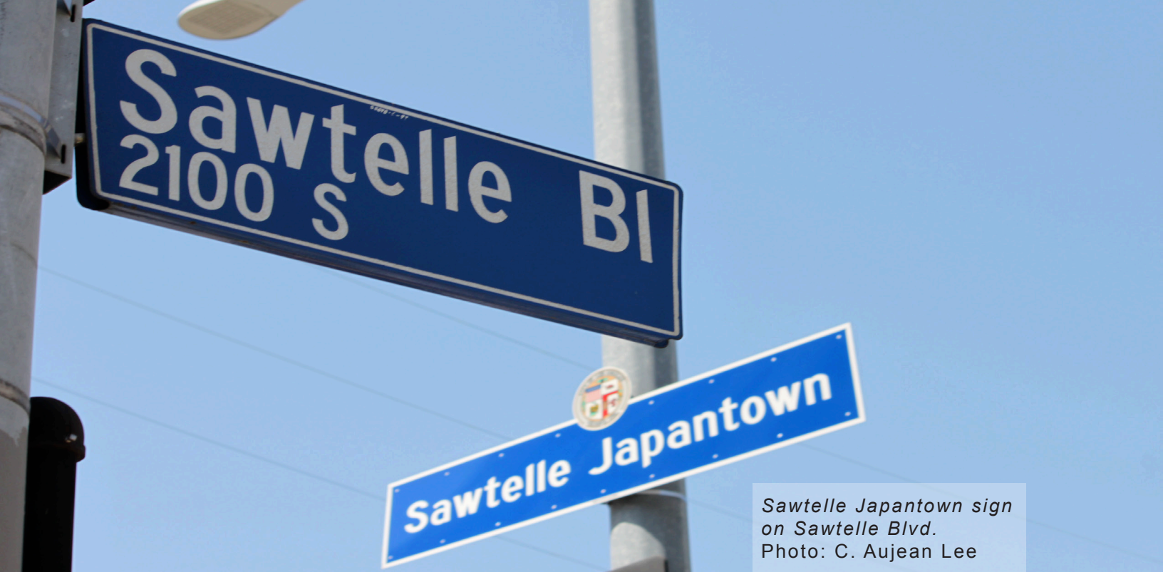
Sawtelle Japantown sign on Sawtelle Blvd.