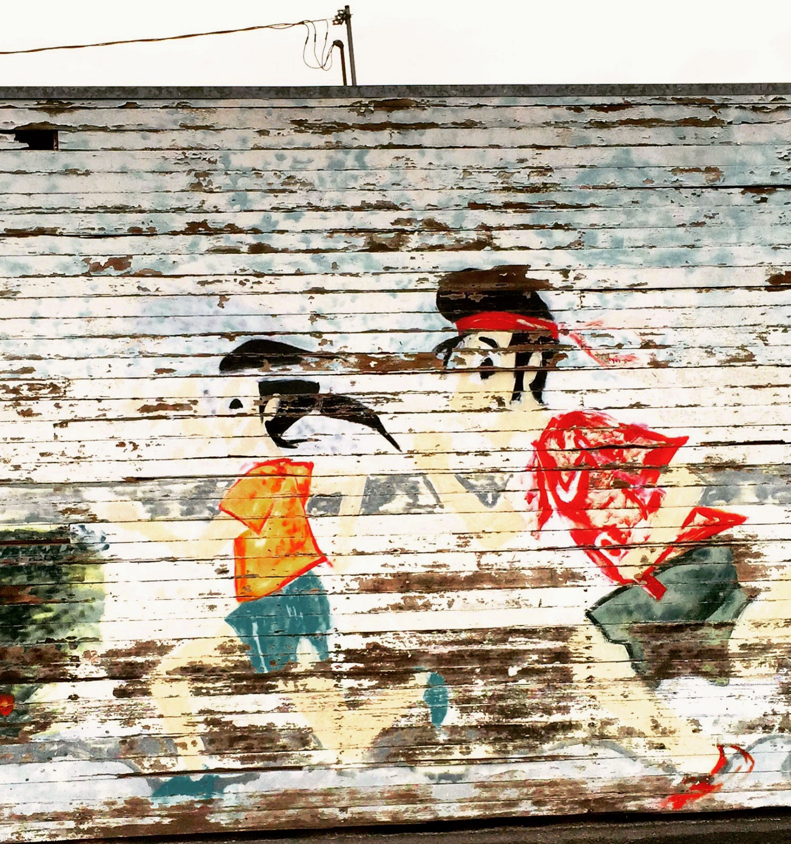
Japanese Institute of Sawtelle mural