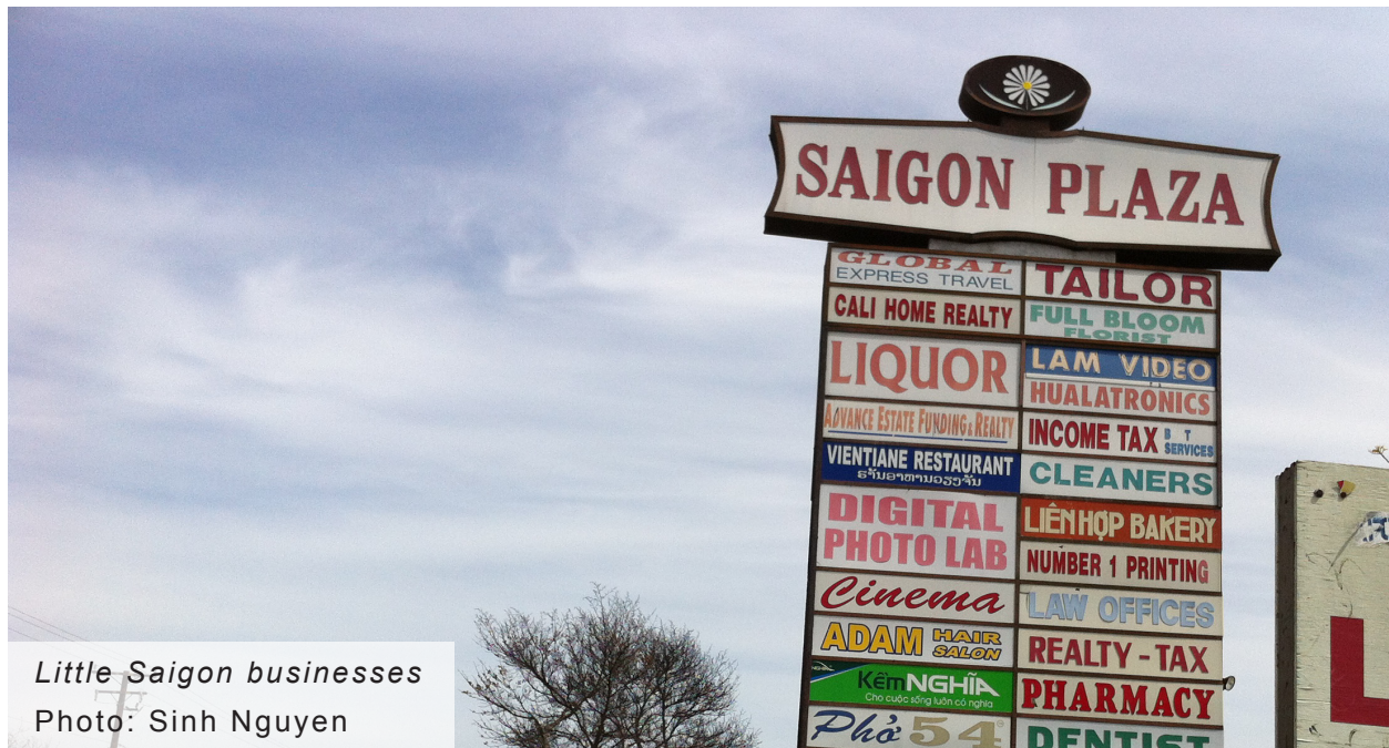
Little Saigon businesses