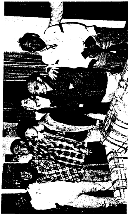
Evening sing along

Those who had been to the village before looked at the trip on a different light. Most of these people had been there quite a few times in the past, and would probably return quite a few more. They saw the visit as both a reunion with friends and recommitment to the dreams and ideals that helped to build Agbayani Village. For them,