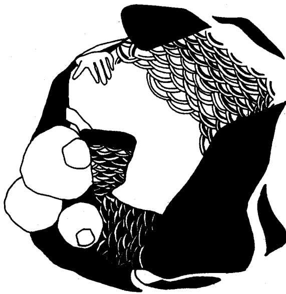
drawing from ECHOES FROM GOLD MOUNTAIN