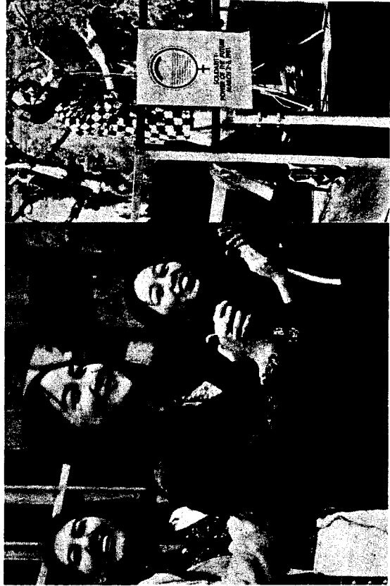
Above: International Women's Solidarity Coalition program at UCLA.