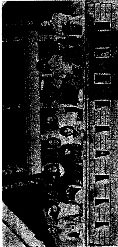
Above: The staff of "Echoes From Gold Mountain, An Asian American Journal," Long Beach, California.