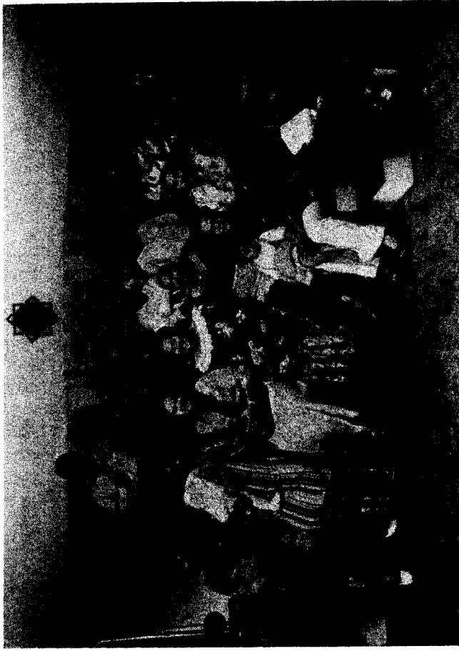
Women's Committee of the Tongan Community System