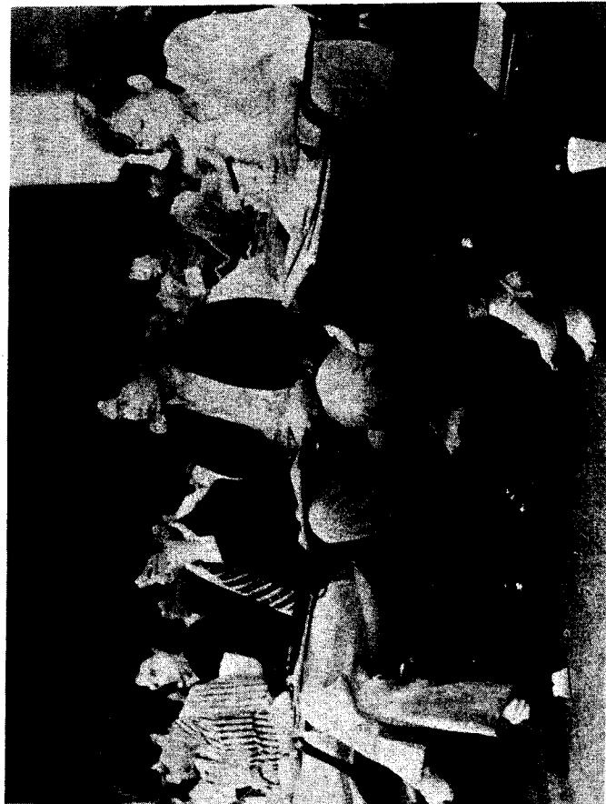
Participants in the Indochinese Refugee workshop at the Asian/Pacific Immigration Conference