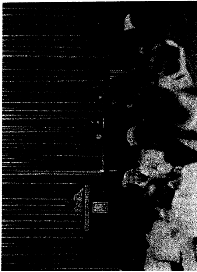
Professor Ron Takaki addressing attendees at the Asian/Pacific Immigration Conference

On the cover: Japanese American grocery store in Haleiwa, Hawaii