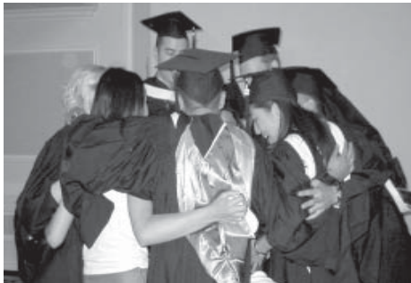
The new graduates huddle together in a group hug, as they've done so many times during their two years in the program.

The UCLA Asian American Studies Center congratulates the M.A. Class of 2002 on all their achievements and is very proud of all those who have passed through its doors on their way to make important contributions to the API community and Asian American Studies.