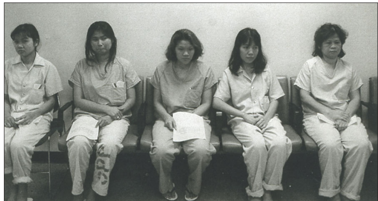
Photo: Some of the workers under federal custody in downtown Los Angeles immediately following the August 1995 raid.