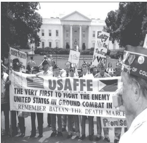
Photo: Filipino veterans demonstrating in front of the White House on July 21, 1998 to appeal to the president to recognize the military service of Filipino WWII veterans.