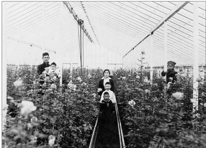
Photos: this page, Fred Korematsu as a child inside the family’s rose nursery. Opposite page, Fred and family, circa 1939.

With his Caucasian girlfriend, Fred planned to move inland to Nevada. He sold his car, threw away his California driver’s license, and on his draft card