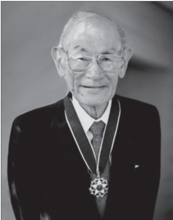
Photo: Fred Korematsu wearing the Presidential Medal of Freedom

the Supreme Court during World War II. The coram nobis rulings also became widely publicized, undermining the widely held view that Japanese Americans were disloyal. In 1988, after intense community organizing and political lobbying, the 100 th Congress passed the Civil Liberties Act, authorizing reparations and mandating a national apology. The apology, sent to each internee in a letter from Presidents Ronald Reagan and George H.W. Bush, read: