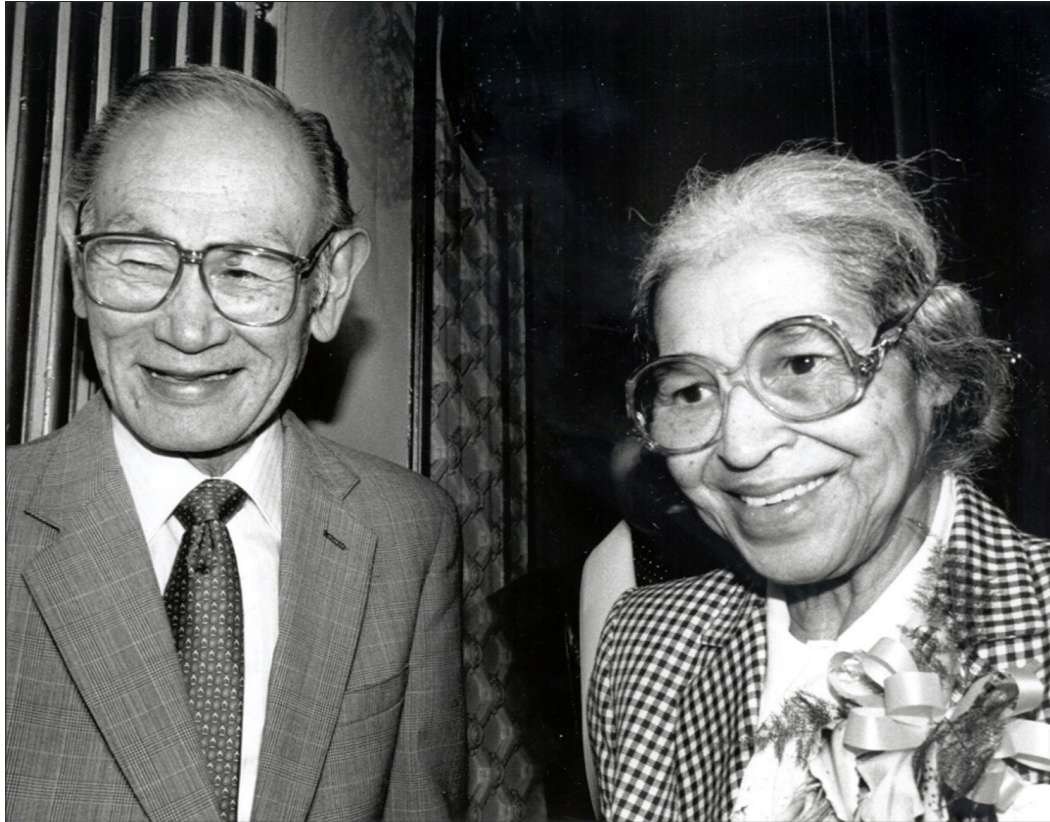
Photo: Fred Korematsu and Rosa Parks at ACLU of Northern California Bill of Rights Day.

military commander, whose views were seriously infected by racism.