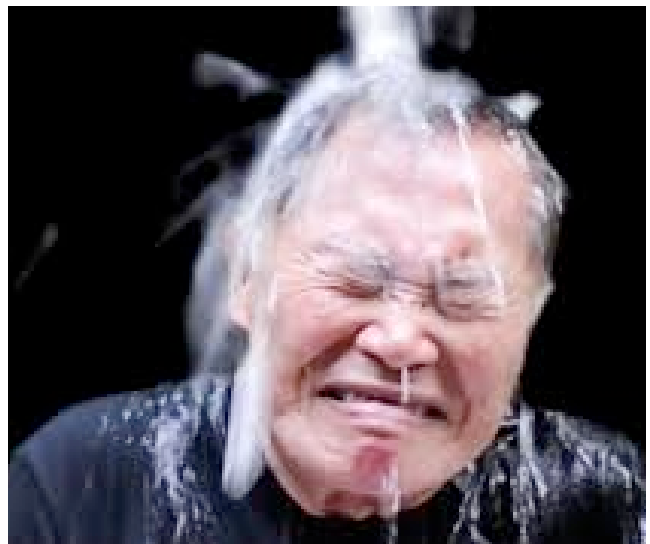
George Takei takes the Ice Bucket Challenge to raise money for ALS (amyotrophic lateral sclerosis). Youtube.com. 2014

Today, George Takei has become a famed actor and leader in many areas for his social justice work. The seeds planted long ago – the experience of internment, the support and influence of parents, and a love of theater combined to grow a myriad of projects and passion, which keep him at the forefront of several contemporary causes. George doesn't believe the different social causes he fights for are separate issues. Rather, he believes “They're all the same; it's a matter of equality, and matter of justice, a matter of what's there.” Not only is he one of the country's most successful Asian American actors, but he uses this success and recognition with great skill in gathering attention and support. Whether he is speaking out for LGBT rights, talking about diversity in acting, or singing on stage, there is no question. George Takei is a leading man.