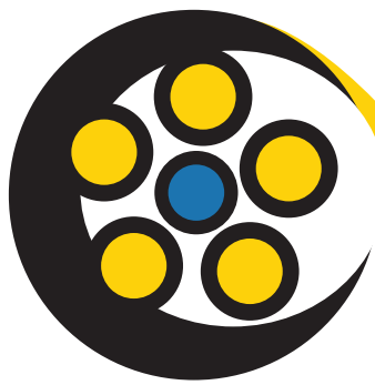
IMAGE MOVERS ASIAN AMERICAN STUDIES CENTER — 50TH ANNIVERSARY — FILM FESTIVAL